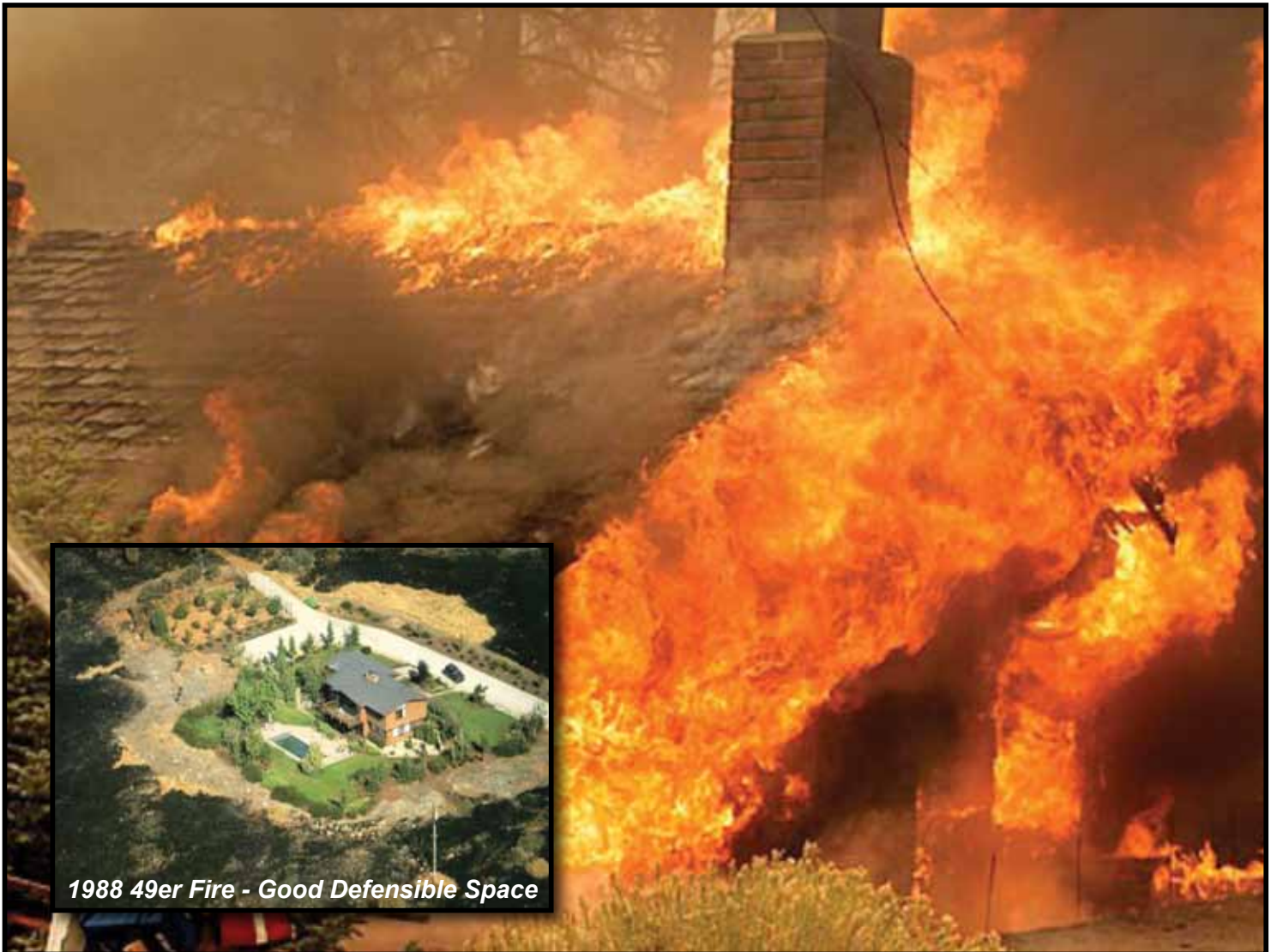
1988 49er Fire - Good Defensible Space

(Including, but not limited to: Lake Vera, Round Mountain, American Hill, Cement Hill, Wet Hill, Purdon, Cooper & Rock Creek)